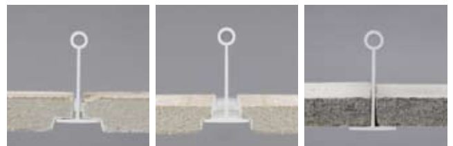
tile interface options