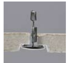
tile interface options

*revealed edge tiles require minimum of 3/8" lip for proper fit with GridMAX grid covers