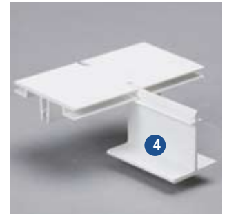
cross tee joint