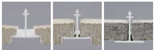
tile interface options